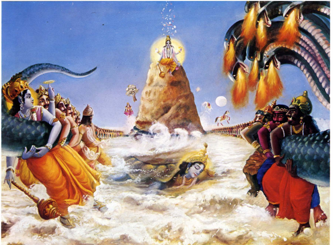
Plate 3 To help the demigods, the primeval Lord assumed the incarnation of a gigantic tortoise, swimming in the ocean of milk. (p. 358)