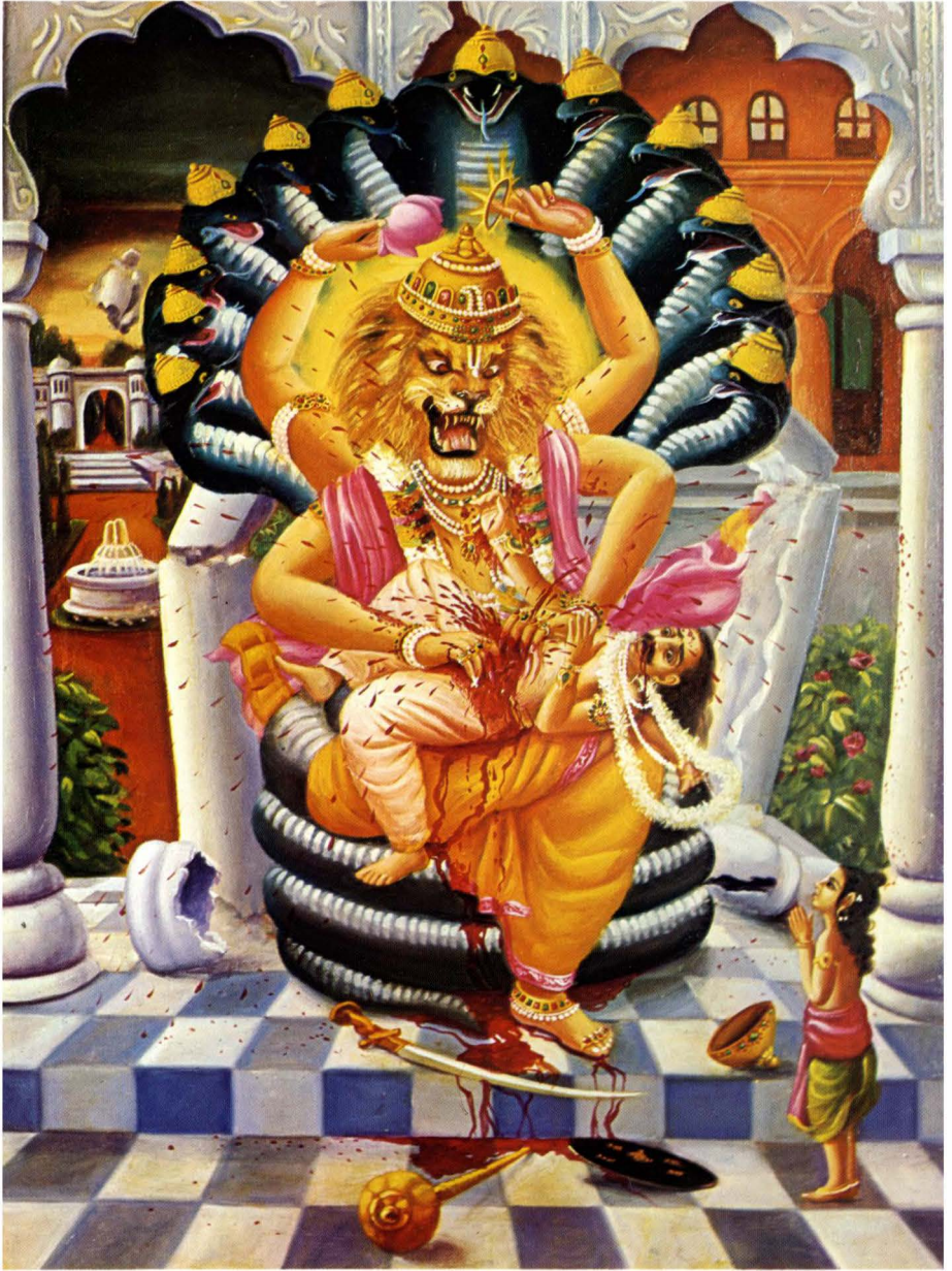
Plate 4 The Personality of Godhead Narasimhadeva killed the demon Hiranyakaśipu by piercing him with His nails. (p. 359)