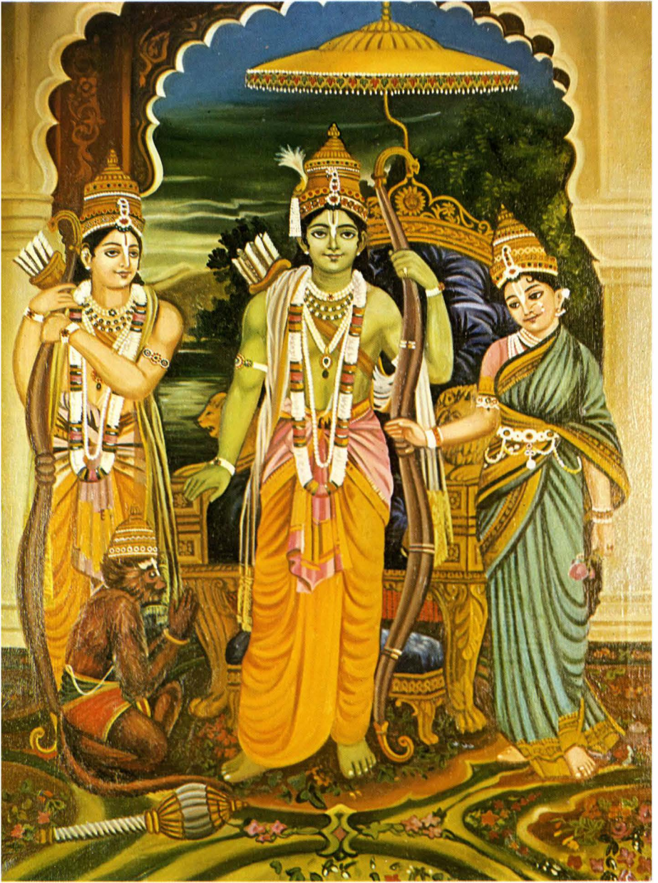
Plate 7 Lord Rāmacandra appeared along with His eternal consort Sītā, brother Lakṣmaṇa and servant Hanumān. (p. 375)