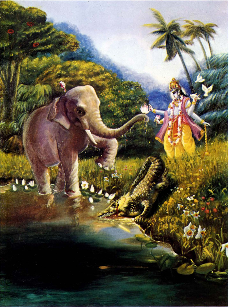
Plate 5 After hearing the elephant's plea, the Lord cut the mouth of the crocodile to save the elephant. (p. 364)