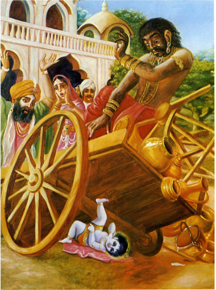
Plate 10 At the age of three months, Lord Kṛṣṇa killed the Sakaṭāsura demon, who had remained hidden behind a cart. (p. 383)