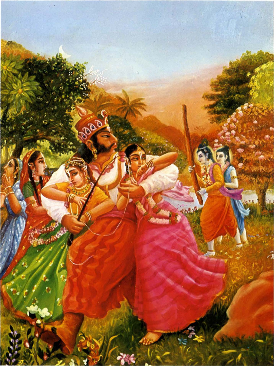
Plate 11 A demon of the name Śaṅkhacūḍa tried to kidnap Kṛṣṇa's cowherd damsels. (p. 391)