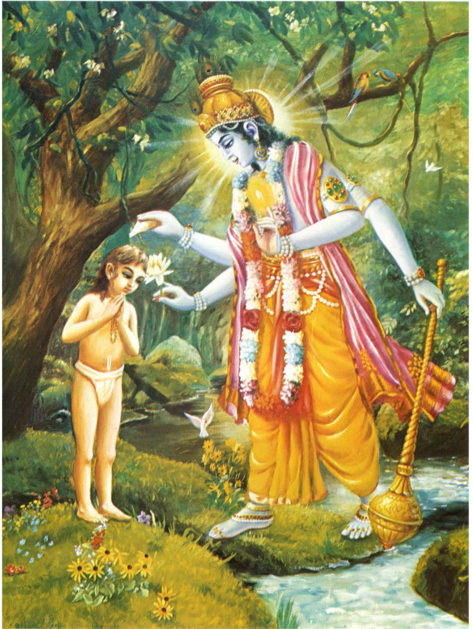
Plate 2 Dhruva Mahārāja is benedicted by the Personality of Godhead. (p. 350)