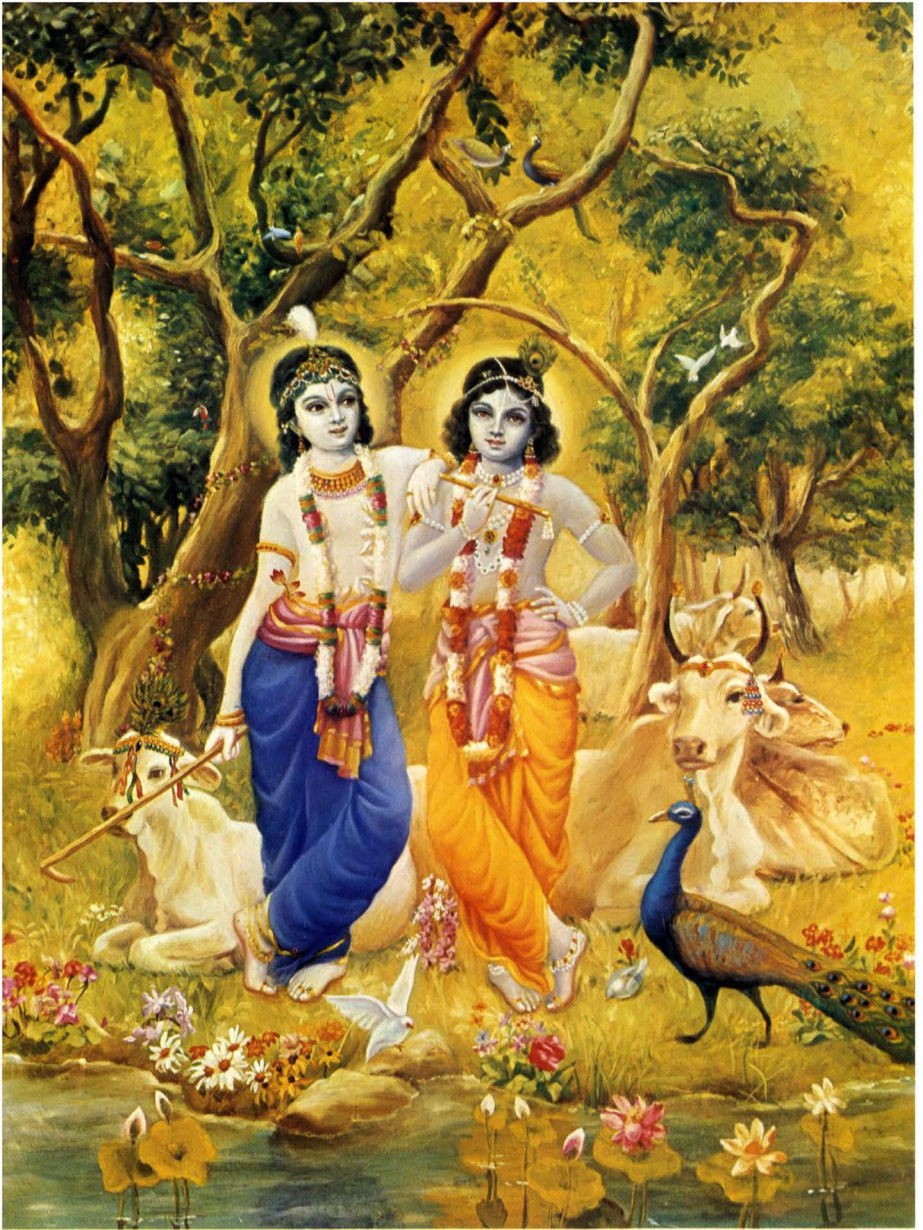
Plate 8 In order to diminish the burden of the world, Lord Kṛṣṇa appeared with His immediate expansion Lord Balarāma. (p. 381)