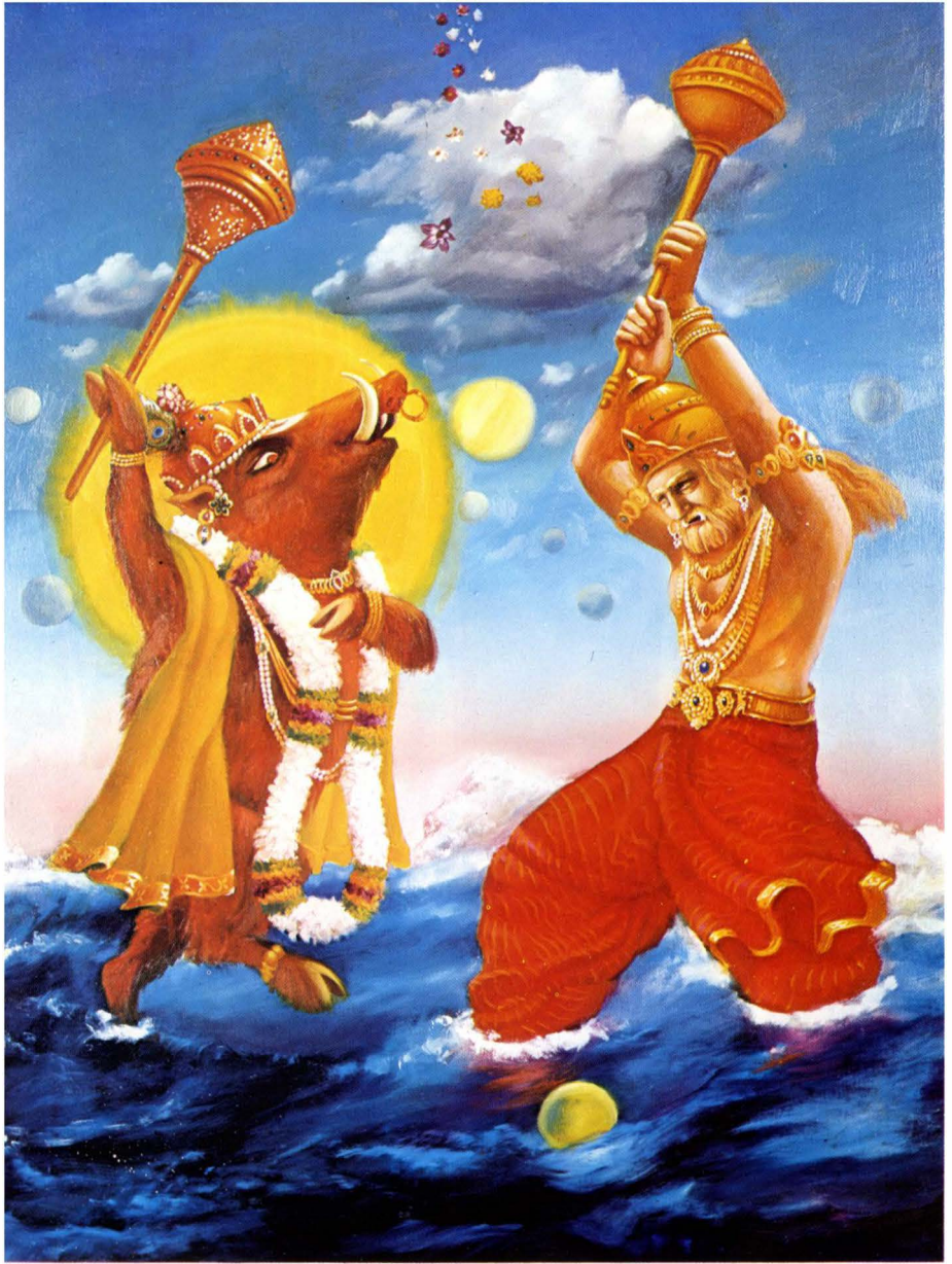
Plate 1 The Lord assumed the gigantic form of a boar and fought with the demon Hiranyākṣa. (p. 338)