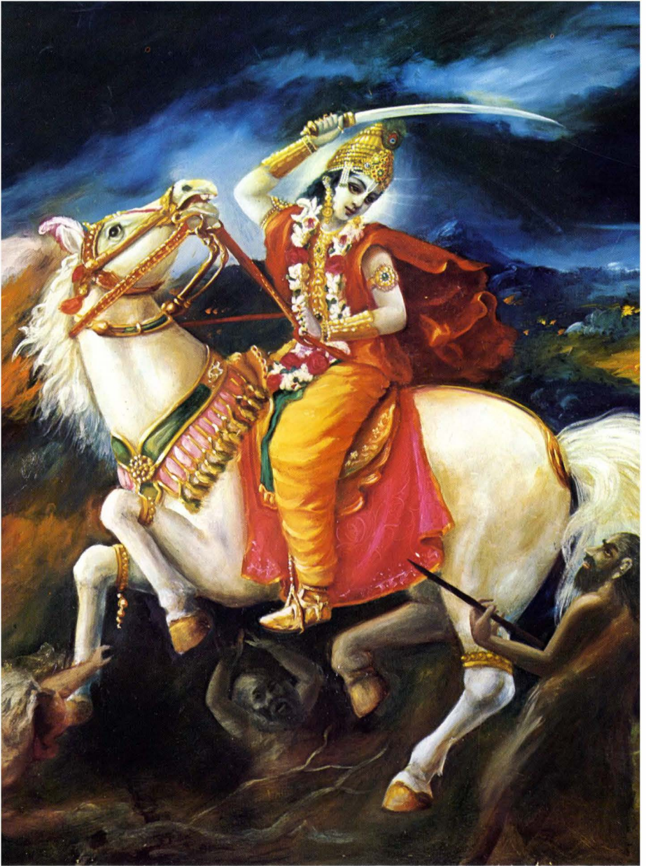
Plate 12 At the end of Kali-yuga the Lord appeared as the supreme chastiser. (p. 397)