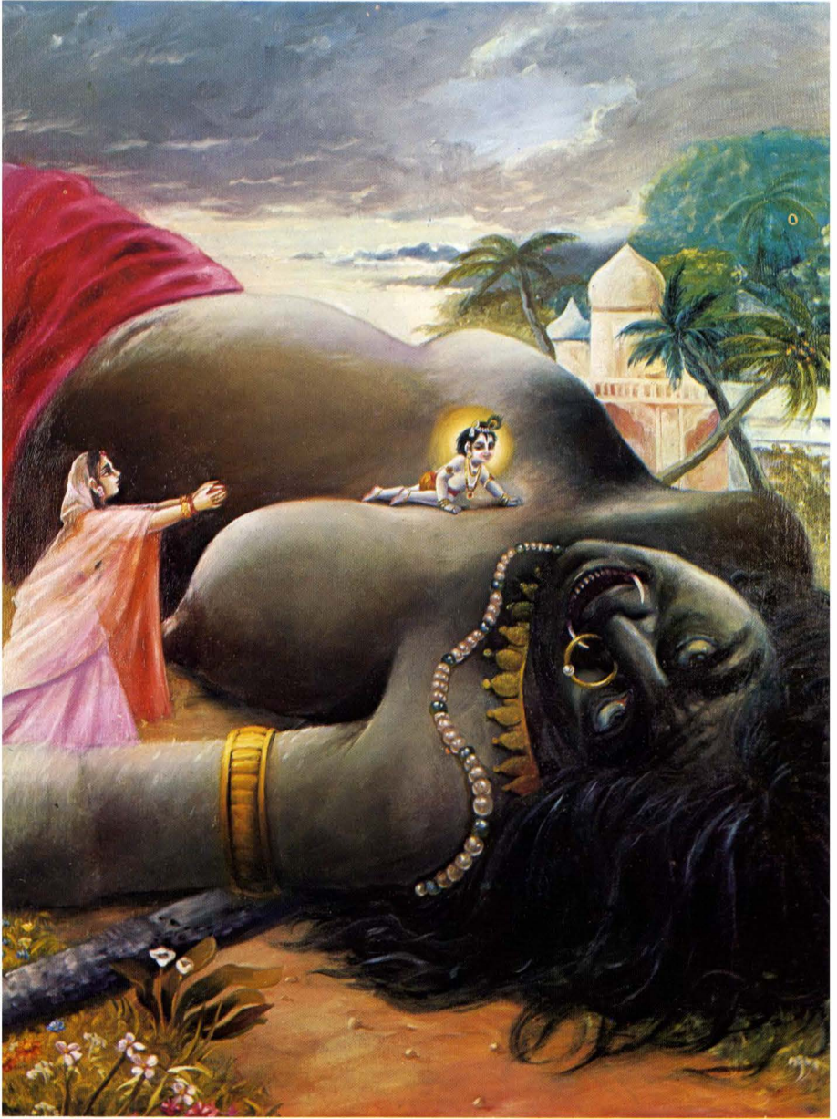
Plate 9 The Lord sucked the breast of the Pūtana witch along with her life air, and the demon's gigantic body fell down. (p. 383)